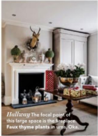
Hallway The focal point of this large space is the fireplace. Faux thyme plants in urns, Oka.