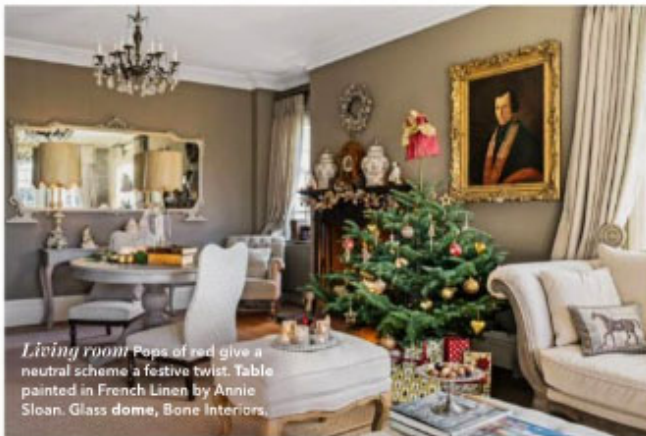
Living room Pops of red give a neutral scheme a festive twist. Table painted in French Linen by Annie Sloan. Glass dome, Bone Interiors.