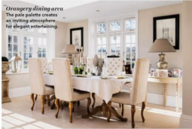
Orangery dining area The pale palette creates an inviting atmosphere for elegant entertaining.