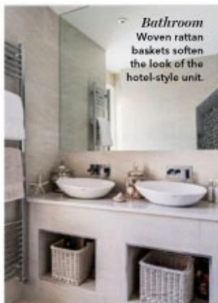
Bathroom Woven rattan baskets soften the look of the hotel-style unit.