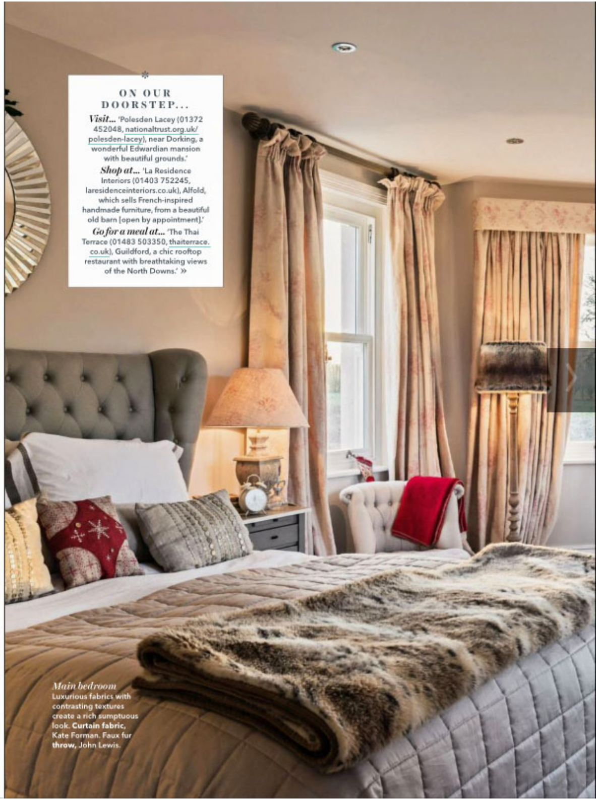
Main bedroom Luxurious fabrics with contrasting textures create a rich sumptuous look. Curtain fabric, Kate Forman. Faux fur throw, John Lewis.

Go for a meal at... ‘The Thai Terrace (01483 503350, thaiterrace.co.uk ), Guildford, a chic rooftop restaurant with breathtaking views of the North Downs.’ »