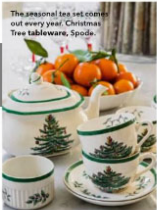
The seasonal tea set comes out every year. Christmas Tree tableware, Spode.

What we love most about living here... ‘Our home has more than two dozen windows so, looking out over the fields at the end of the day, we often enjoy amazing sunsets’